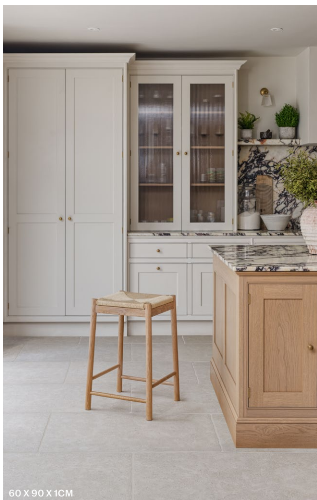
60 X 90 X 1CM