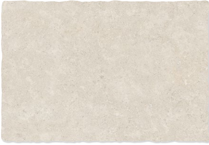
60 X 90 X 1CM