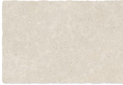
60 X 90 X 2CM (PAVING)