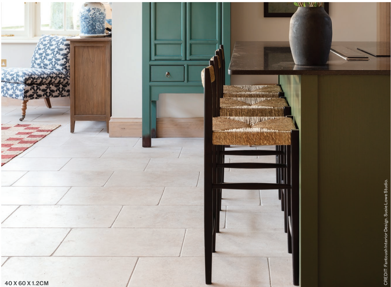
40 X 60 X 1.2CM

CREDIT: Fantoush Interior Design, Susie Lowe Studio.