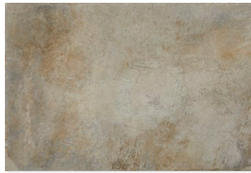
60.4 X 90.6 X 1CM