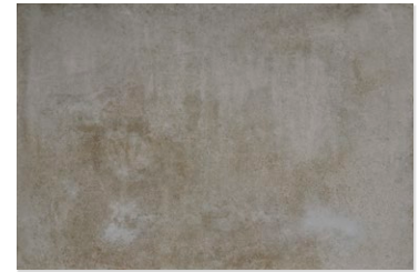
60.4 X 90.6 X 2CM (PAVING)