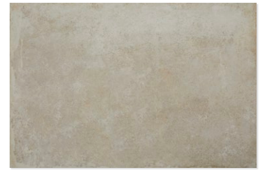
60.4 X 90.6 X 2CM (PAVING)