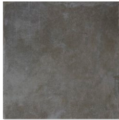
60.4 X 60.4 X 1CM