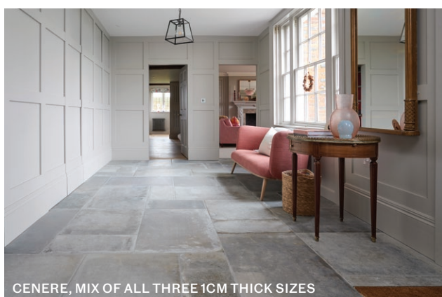
CENERE, MIX OF ALL THREE 1CM THICK SIZES