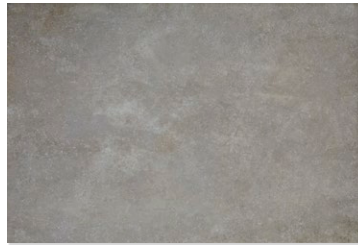
60.4 X 90.6 X 1CM