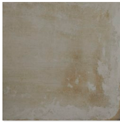
60.4 X 60.4 X 1CM