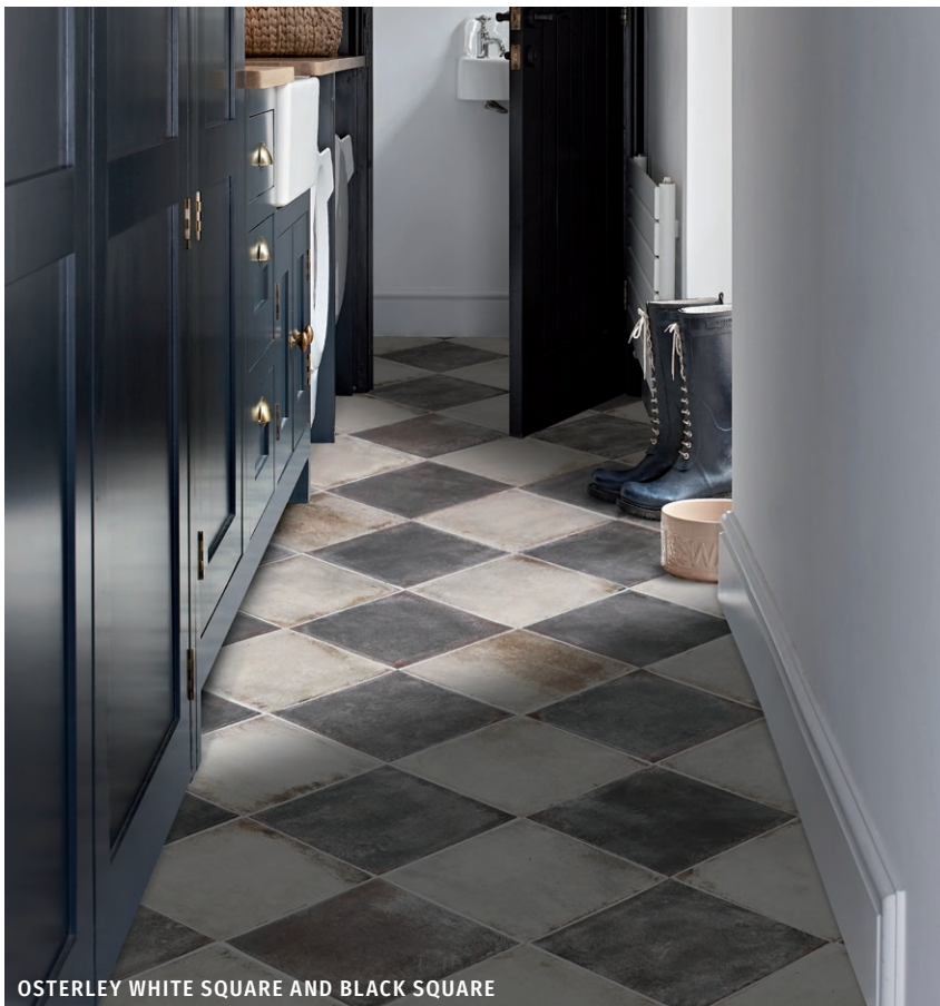
OSTERLEY WHITE SQUARE AND BLACK SQUARE

The ground floor at Osterley Park in Middlesex displays an iconic chequerboard limestone floor, worn over the years by the passage of scullery maids and footmen. Our Osterley porcelain tiles authentically replicate this aged look, but with all the practicality and low maintenance of porcelain, and an R11 slip rating for use indoors and out.