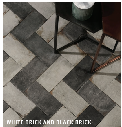
WHITE BRICK AND BLACK BRICK