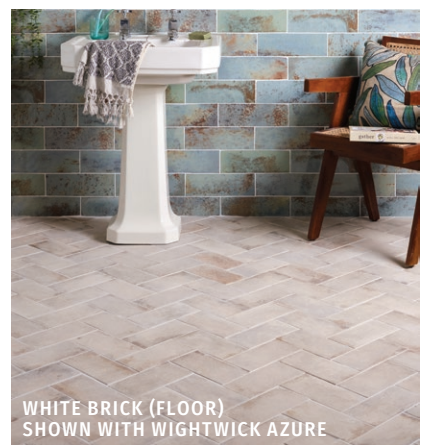
WHITE BRICK (FLOOR) SHOWN WITH WIGHTWICK AZURE