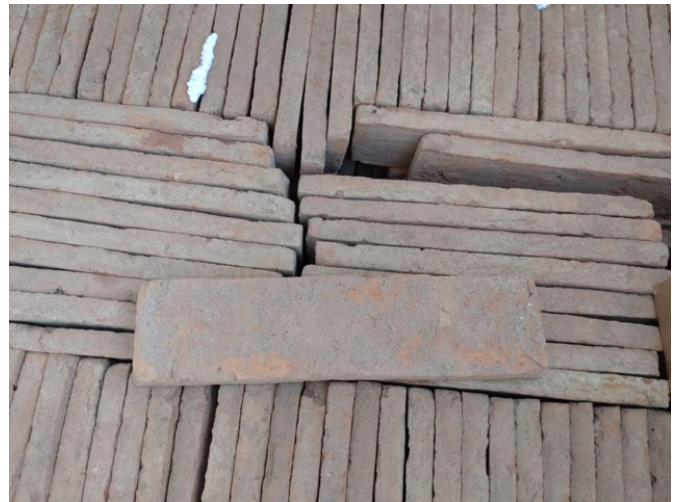
MARLBOROUGH TERRACOTTA, IN ITS RAW STATE IN THE CRATE. DUST/DIRT IS TO BE EXPECTED.

Another important aspect is the installation of the product. Prior to installation, it is important that the material is stored out of humidity or rain, as it is best to lay the product when dry. Make sure that the adhesive used is a terracotta friendly adhesive. We would recommend our Sarsen Home Premium Semi-Rapid adhesive, or a similar product. It is very important to butter the entire back of the tile with adhesive