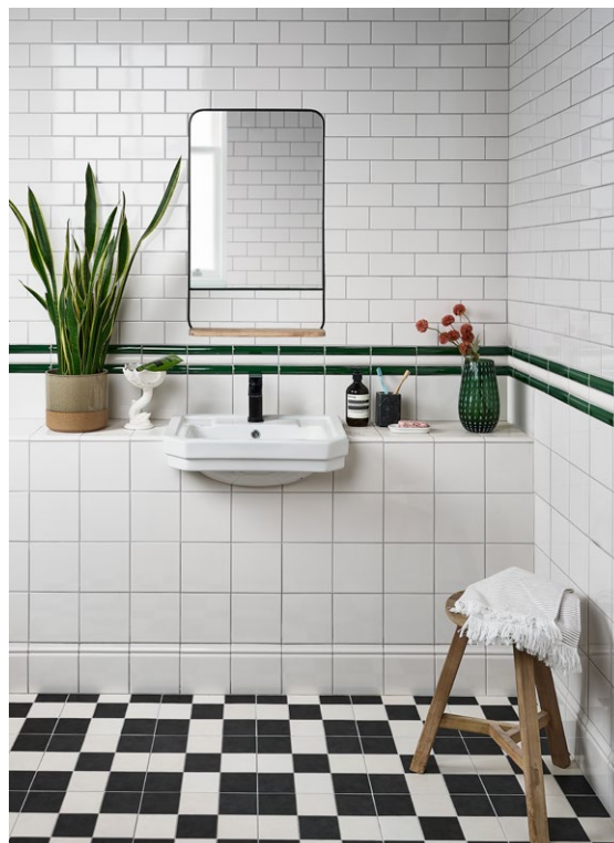
COTTON WHITE SKIRTING, SQUARE, SIMPLE BEADING, METRO AND OLIVE GREEN SIMPLE BEADING SHOWN WITH CHESS MONO A