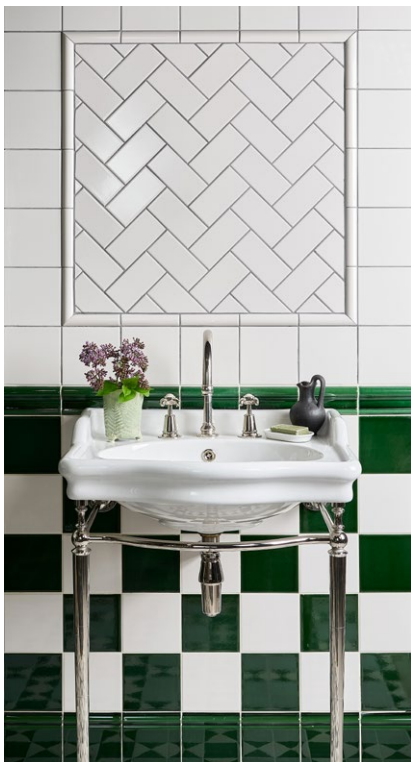
COTTON WHITE SQUARE, SIMPLE BEADING & METRO, OLIVE GREEN SQUARE, DADO AND CLASSIC SKIRTING

Traditional Victorian bathrooms, made beautiful by the detailed layering of mouldings, decorative borders, and wall-to-wall tiling, have always been an inspiration to us - so we created our own range, in traditional tones still loved today.