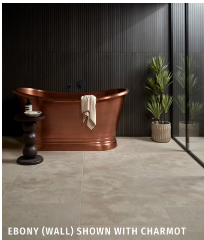
EBONY (WALL) SHOWN WITH CHARMOT

Creating the effect of slatted wood panelling but hardy enough for use in any area, these tiles give an undeniably elegant linear feel.