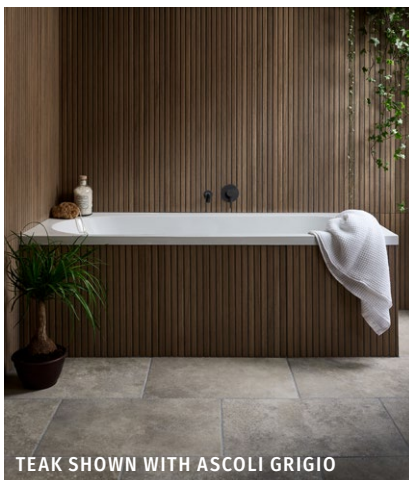
TEAK SHOWN WITH ASCOLI GRIGIO