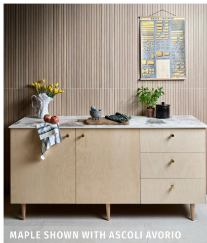
MAPLE SHOWN WITH ASCOLI AVORIO