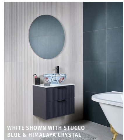
WHITE SHOWN WITH STUCCO BLUE & HIMALAYA CRYSTAL