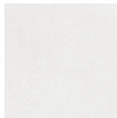
EXAMPLE GLASS HOUSE TILES