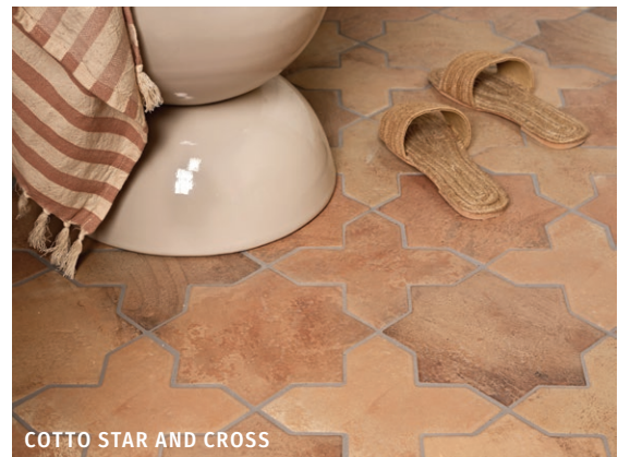
COTTO STAR AND CROSS