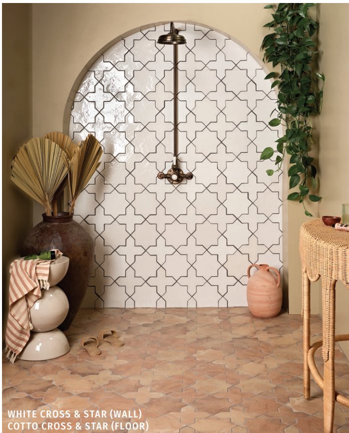
WHITE CROSS & STAR (WALL) COTTO CROSS & STAR (FLOOR)