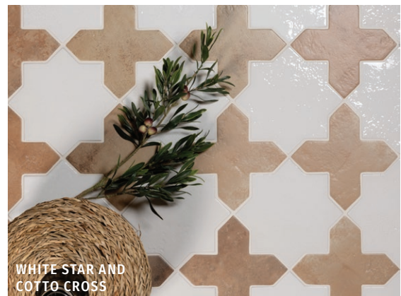
WHITE STAR AND COTTO CROSS