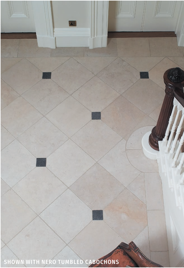
SHOWN WITH NERO TUMBLED CABOCHONS

A perfect stone for large, open spaces. Fontaine is dense and clean with subtle variations in tone and occasional fossil markings. A little like marble that has aged and mellowed, this is a sophisticated stone that gets better with time.