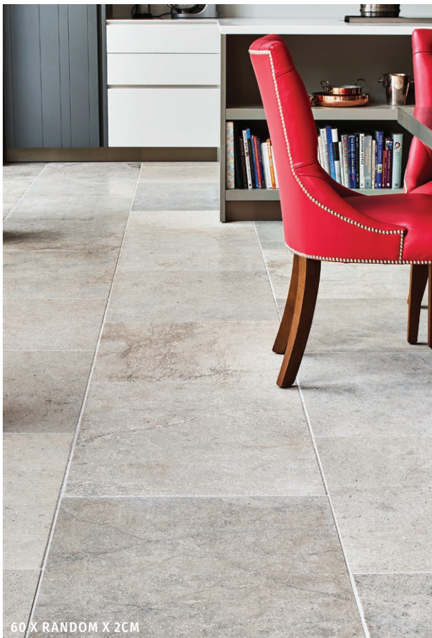
60 X RANDOM X 2CM

This is a strikingly-textured, hard limestone with lively colour tones ranging from steel grey to putty and plenty of character in the shell markings and veins. It's an ideal option for larger spaces which do justice to the stone's full beauty.