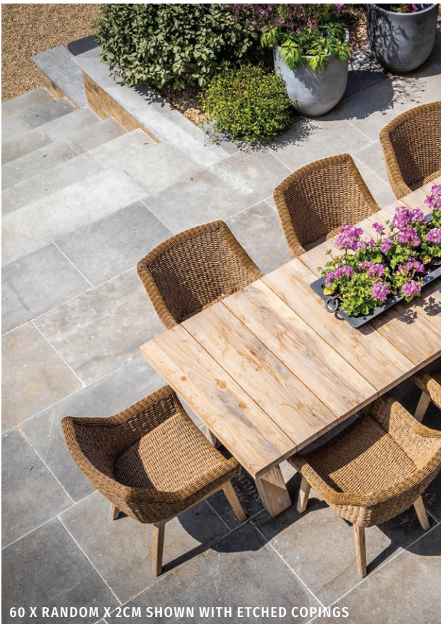
60 X RANDOM X 2CM SHOWN WITH ETCHED COPINGS

The tumbled and etched finish has a modern yet rustic look, making it the perfect stone for fuss-free terraces, patios, and pools, whilst offering additional grip indoors.